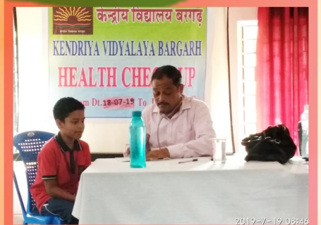
Health Checkup of all the students is a regular practice in KV Bargarh. First phase health checkup done on 18.07.2019.