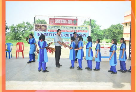
Kendriya Vidyalaya Bargarh organised Investiture Ceremony for newly joined Cubs Bulbuls and Scouts & Guides .