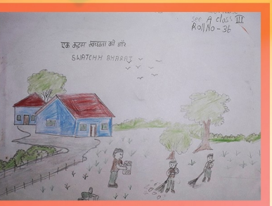
Jyotiranjnan Kalse, III A