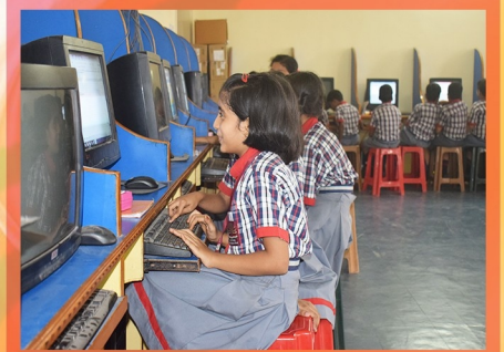
Teachers conducting practicals in the Laboratories .