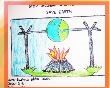
Subhrasikta Dash, III B