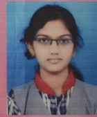
GALAXY SAHU 90.2 %